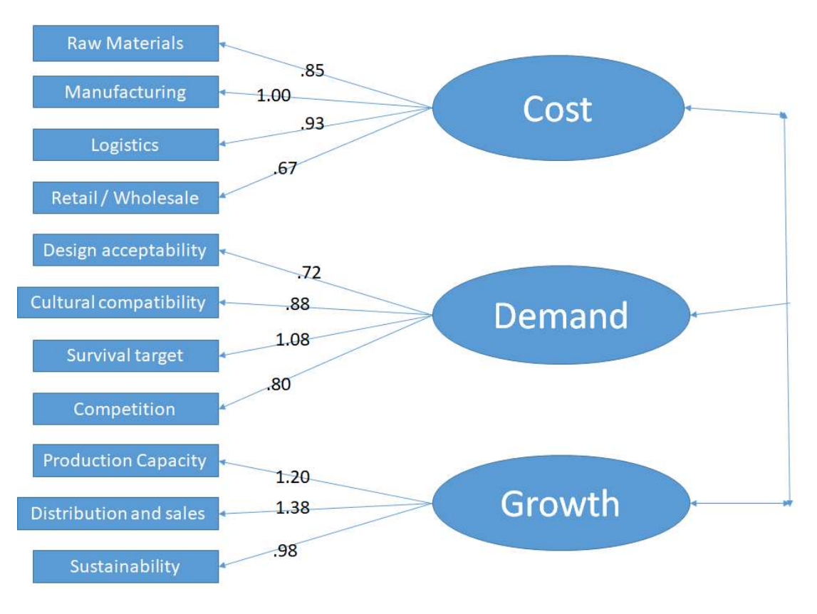
Fig 5 Path diagram for the first order CFA