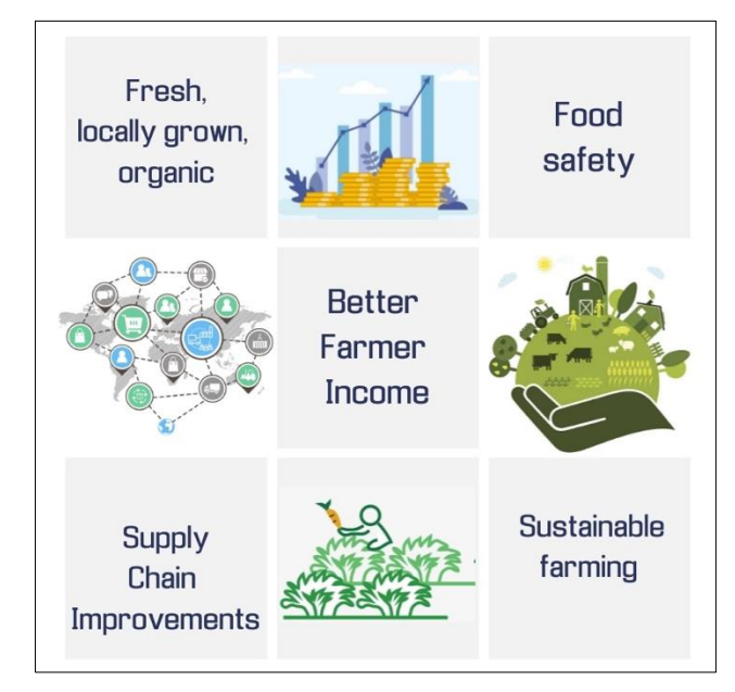
Figure 1 - Emerging AgTech Themes

Armed with significant inflows of venture capital and government investment, AgTech is emerging as a new industry worldwide. Many new businesses and marketplaces are waking up to the importance of providing fresh, locally grown organic products, and ensuring food safety. They are working towards adopting sustainable agriculture practices, and using technology to streamline their supply chains. See Figure 1.