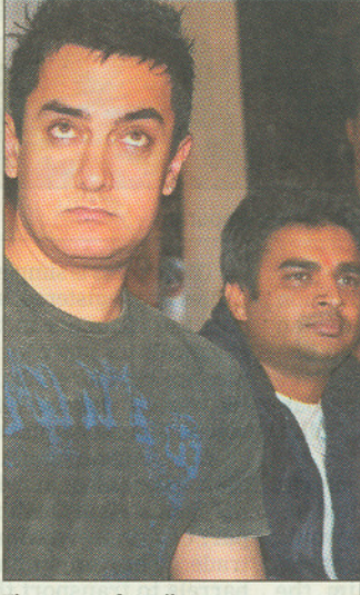
The crew of '3 Idiots' was mobbed at a mall in the city during a promotional event on Tuesday. Aamir was at his witty best during the press conference. The crew at a hotel in Whitefield, where they stayed